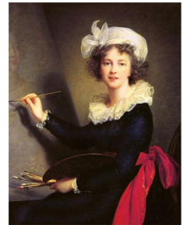
Elisabeth Vigée-Lebrun, Self-Portrait , 1790.