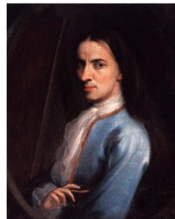
Juan Rodríguez Juárez, Autorretrato (Self-Portrait) , 1719.