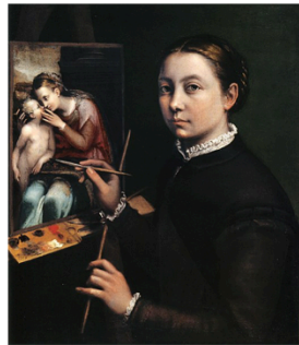
Sofonisba Anguissola, Self-Portrait at the Easel , 1556.