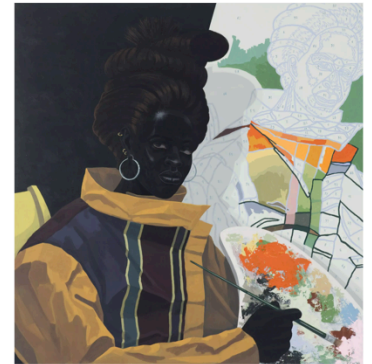
Kerry James Marshall, Untitled (Painter) , 2009.