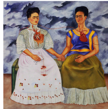
Frida Kahlo, Las dos Fridas , 1939.