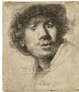
Rembrandt van Rijn, Self Portrait with Beret , 1659.