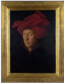
Jan van Eyck, Self Portrait , 1433.

Prior to attending class, students will explore a selection of course content (videos and reading) in our Canvas classroom. We will meet in person to participate in small-group and discussion activities relating to the course material on Monday from 1-2:15 PM, Osceola Campus - Building 1, Room 127.